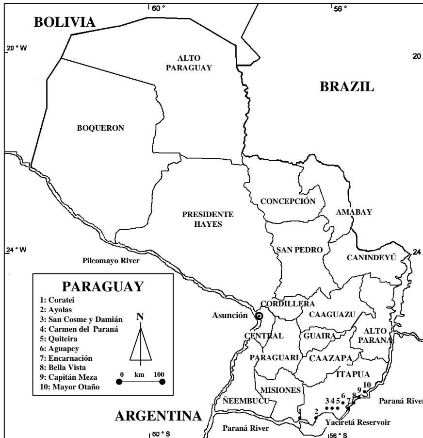
Fig.1: Phlebotominae collection sites with CDC light trap from 1993 to 2001, Paraguay.

ture of 16 phlebotomine/day and 64 L. neivai in the overall collection. No phlebotomine was obtained at the Carmen del Paraná site.