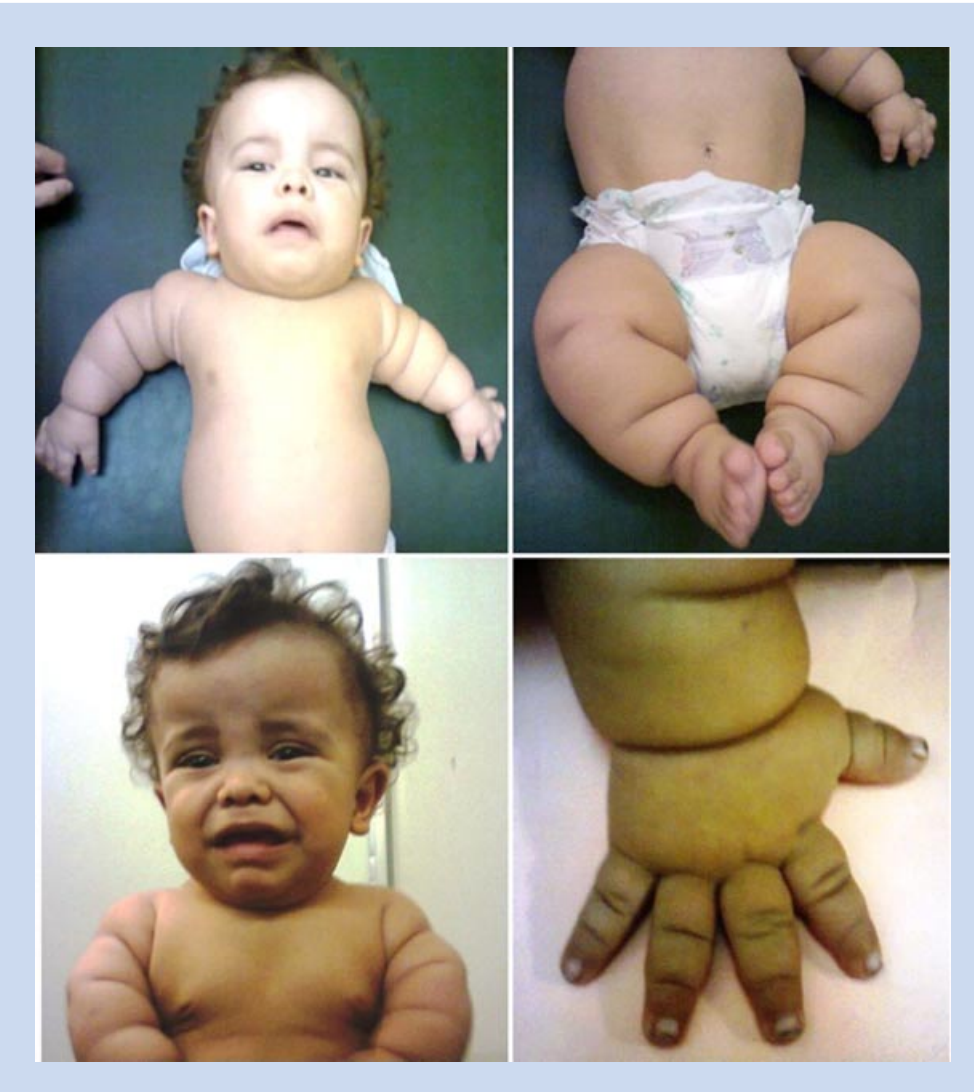
FIG. 1. Patient at 16 months of age. Note frontal bossing with midface hypoplasia and rhizomelic shortness of arms and legs and trident configuration of hand.

nation his length was 68 cm (-4.0 SD) for Argentinian growth standards [Lejarraga et al., 2009] his weight was at 50th centile and OFC at 97th centile, he showed disproportionate short-limb dwarfism with large head, frontal bossing, depressed nasal bridge, narrow thorax, short hands with stubby fingers, trident hand configuration, shortness of arms and legs with bowlegs and excess skin creases (Fig. 1). He showed delay in gross motor skills and language. A skeletal survey revealed marked shortening of the long bones with flaring of the metaphyses, short and squared ilia with marked narrowing of the sacrosciatic notches, oval-shaped lucent appearance of the proximal femora, and mild decreased interpediculate distance in lumbar spine (Fig. 2).