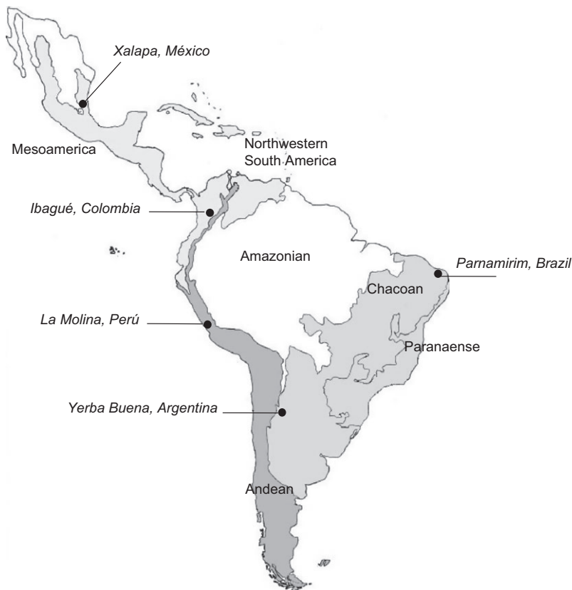
Figure 1 Collection sites of Anastrepha fraterculus flies of the Mexican (Xalapa, Mexico), Andean (Ibagué, Colombia), Brazil-3 (Parnamirim, Brazil), Peruvian (La Molina, Peru), and Brazil-1 (Yerba Buena, Tucumán, Argentina) morphotypes. Collection sites were highlighted on a map showing major biogeographic areas according to Morrone (2006) and modified by Hernández-Ortiz et al. (2012).

For pre-zygotic isolation tests, 20 sexually mature virgin males and 20 sexually mature virgin females of the Brazil-1,