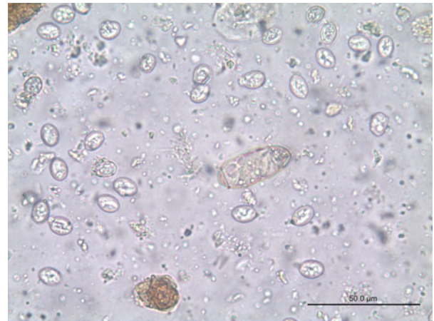
Fig. 2. Photomicrograph of a direct saline smear from a pooled fecal sample of four Morelia viridis showing numerous Sarcocystis sp. sporocysts and a digenean trematode egg.

described (Moré et al. 2013) and submitted to the Lightrun service of GATC Biotech ( www.gatc-biotech.com/lightrun ) for DNA sequencing. Sequences were aligned and assembled using the pair-wise global alignment with free end gaps and a similarity cost matrix of 65% from GENEIOUS.