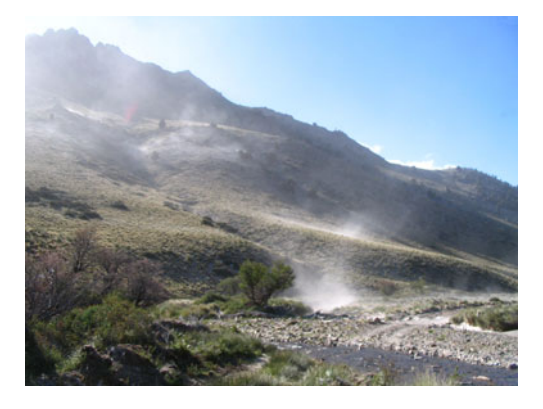
Fig. 2 Ecotonal landscape in Patagonia (study area). Although known for commonly strong eolic conditions, this was a 'calm' day without westerlies: this turbulence is due to daily thermal wind patterns that shift ashes in any direction

Evidence for at least a partial barrier to fluoride transfer in utero as well as during lactation has been mentioned regarding ungulates (Cronin et al. 2000; Kierdorf et al. 1996a; Richter et al. 2011). Although it has been proposed that fluoride passes transplacentally in cattle based on a single fetus (Krook and Maylin 1979), Shupe et al. (1992) found