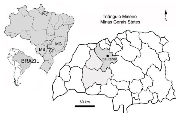
Figure 1. Ituiutaba District location, Triângulo Mineiro region, Brazil. MS: Mato Grosso GO: Goiás, MG: Minas Gerais, SP: São Paulo.

As mention before, ID has its local institutions and policies to preserve its CH and its pre-