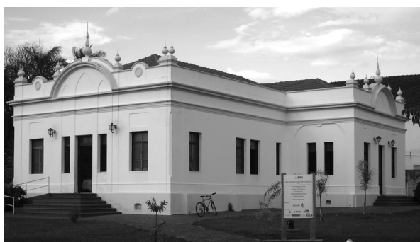
Figura 6. Cultural Center/MUSAI, Ituiutaba District.