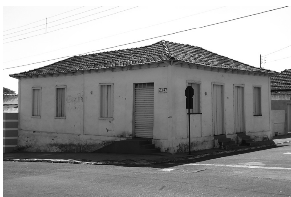
Figura 5. do Capitão Shoe Store, Ituiutaba District.