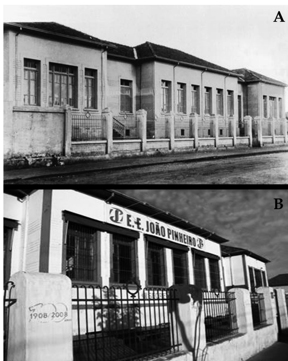
Figura 4. João Pinheiro School, Ituiutaba District. A: School in 1920, B: The School today.