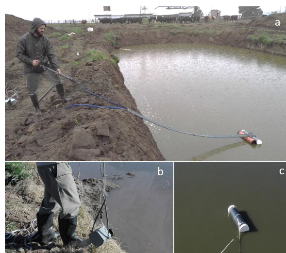
Figure 1 Device used for sampling. (a) Water extraction pump system with manual pump; (b) sediment collection dredge; and (c) surface buoy for Moore swabs.

Five grams or milliliters of each sample were resuspended in 50 ml of peptone water (Britania, Argentina) and incubated at 37 °C for 24 h. Subsequently, the presumptive detection of coliforms was carried out by inoculating 1 ml of the enriched culture into a tube containing 9 ml of MacConkey broth (Britania, Argentina) with a Durham tube, and incubated at 37 °C for 24 h. Positive samples (color change to yellow and gas production) were streaked onto Petri dishes containing MacConkey agar (Britania, Argentina) using a loop,