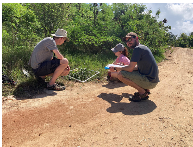
Figure 2. Flower-insect timed counts through a program organized by the Anguilla National Trust

Studying interactions among multiple species at large scales is exceptionally time consuming and, in many cases, simply impractical because of the numbers of species and range of interactions involved in complex networks. Engaging citizen scientists in studying insects through initiatives such as flower-insect timed counts (Figure 2), where volunteers count all the insects visiting a specific flowering plant within a quadrat over a given time period, is providing robust and invaluable datasets for assessing change over time and across large scales. The use of smartphone applications to guide citizen scientists, taking them step by step through the survey method and assisting with species identification through artificial intelligence alongside automated feedback, which can provide additional information on their observations, is revolutionizing citizen science.