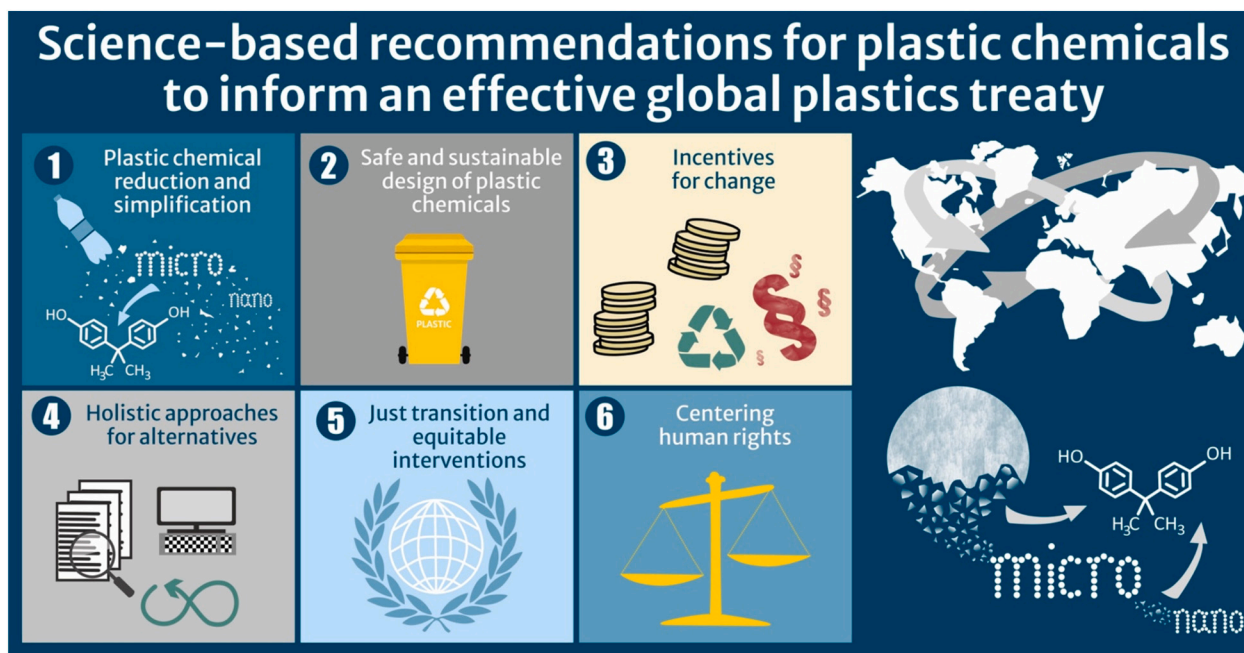
Fig. 2. The six science-based pillars recommended as approaches for effectively addressing and reducing plastic pollution on a global scale.

chemicals, are considered when addressing pollution by MNPs and plastic chemicals. Furthermore, it is imperative that evaluations of plastics' impacts are conducted with a focus on hazards, and categorized into families of plastic chemicals classified as hazardous in regulatory lists (Wagner et al., 2024). Indeed, the hazard-based approach should be complemented with a group-based approach to effectively address groups of chemicals rather than individual substances (Wagner et al., 2024).