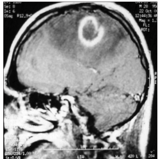
Fig 1. Patient 1. MRI showing a round lesion at the right parietal lobe surrounded by an enhanced gadolinium ring and oedema.

On clinical examination he presented a left-sided hemiparesis with hyperactive reflexes. Ordinary laboratory tests were unremarkable, except for a very low count of CD4+ lymphocytes, which amounted to 70 cells/mm 3 . Serum ELISA and Western Blot were positive for HIV infection and an indirect immunofluorescence assay (IIA) for Toxoplasmosis was positive as well. Serological tests for Chagas' disease (IIA, ELISA) and a search for trypomastigotes in blood were negative.