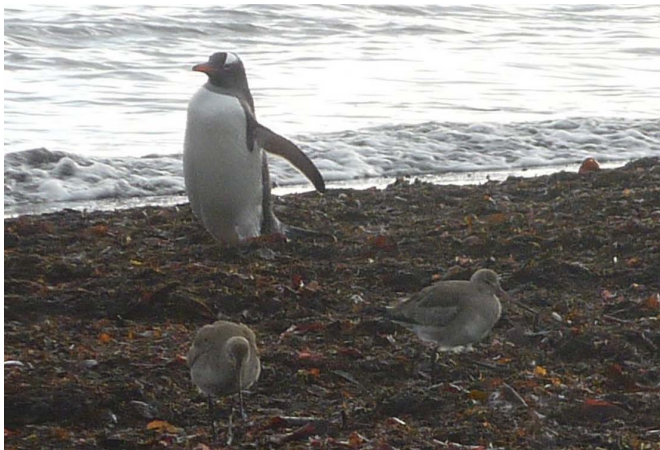
FIGURE 2. Two individuals of Hudsonian Godwit Limosa haemastica at Potter Peninsula, 25 de Mayo/King George Island, South Shetland Islands, 21 October 2008.

The most common factor offered to explain vagrancy according to these authors are unusual weather conditions, such as storms or droughts, which drive birds away from their normal distribution and migration routes (Orgeira and Fogliatto 1991). Strong winds were registered in both years just before the dates when the Limosa haemastica reported herein were observed. From the end of December 2004 to the beginning of January 2005 winds over 40 knots, especially from the north, prevailed in the Esperanza Base area. Similar conditions were registered in October 2008 at Jubany Base, where the strong northerly winds reached 22 - 46 knots, exceeding 50 knots in September. It could well be that the presence of these birds in our study areas is associated with these weather conditions, such as the wind speed and direction, thus facilitating their movement south from southern South America.