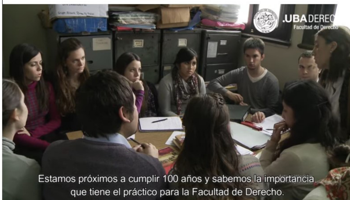
Figure 2 Students and teacher in the Legal Aid rooms of the Palace of Justice, Autonomous City of Buenos Aires