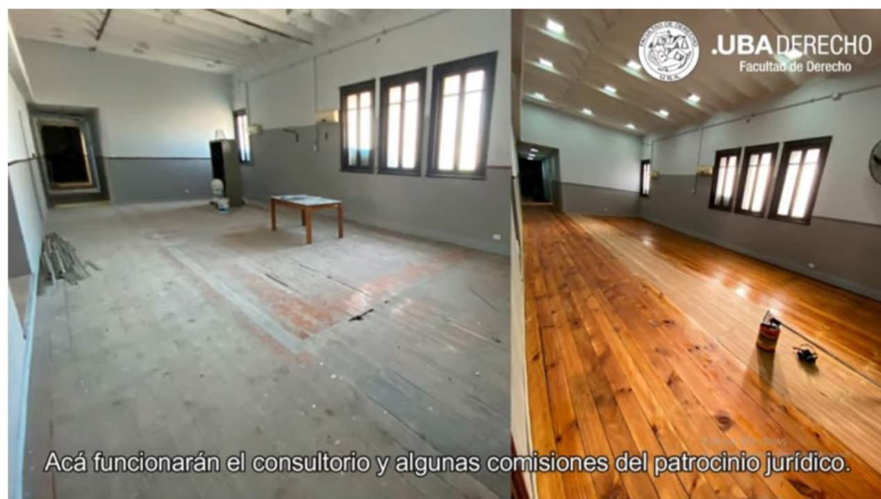
Figure 3 Legal Aid rooms of the Palace of Justice, Autonomous City of Buenos Aires