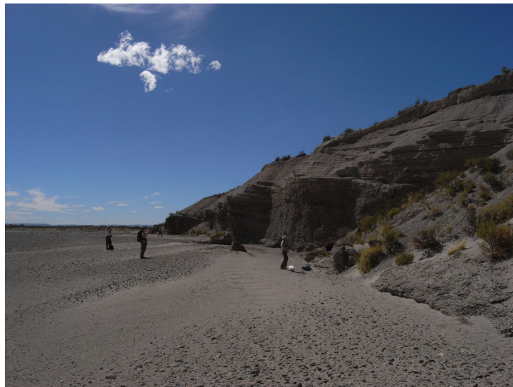
Figure 5. Section in marine deposits along the Cañadón Malaspina.

high concentration of organic material. Generally they are covered by typical halophyte plants.