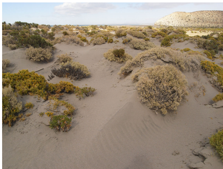
Figure 7. Dunes in Península Aristizábal.