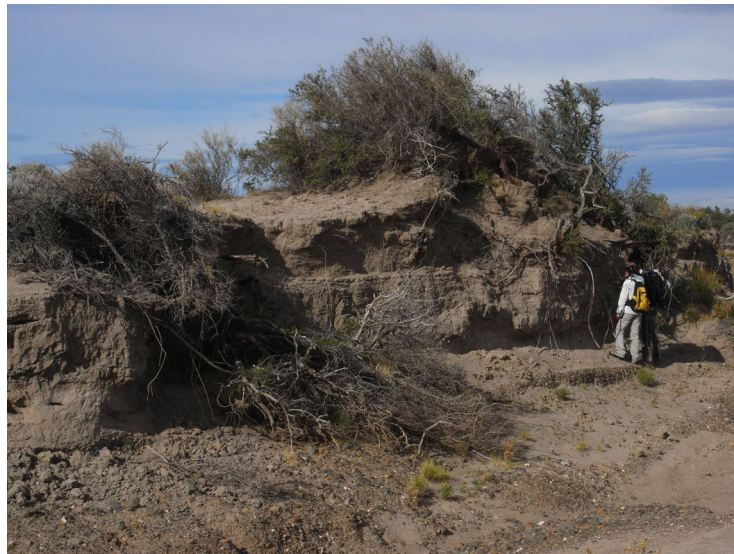
Figure 6. Stabilized dune covers fluvial deposits in Cañadón Restinga.