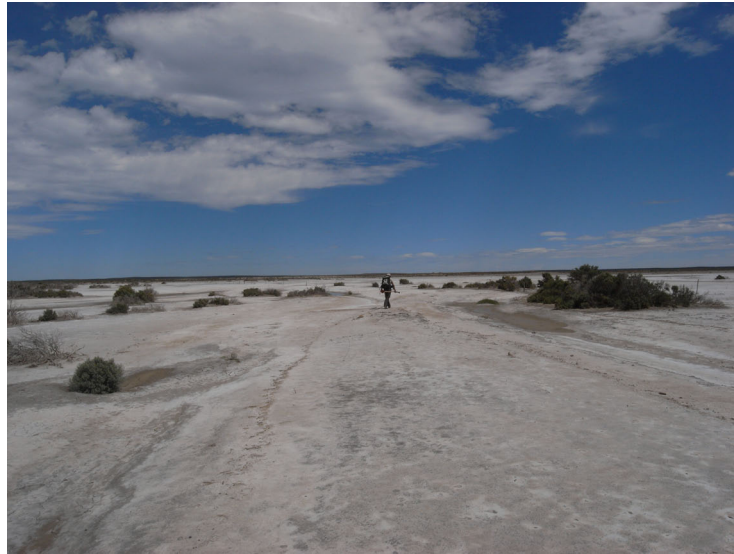
Figure 4. Salitral near the village in Bahía Bustamante.