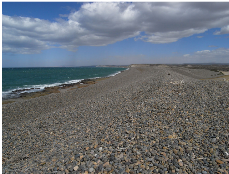
Figure 3. Holocene Beach ridge series in Península Aristizábal.

metres thick to series of relict forms that are very large and thick. These latter may extend several kilometres inland rising to more than one hundred metres above current sea level. These deposits may occur in singular form often dissected by fluvial erosion, or as sets characterised by crests located at the same elevation (Figure 3). Their curvature varies from almost straight (in the higher and older forms) to very curved, tracking the variation of the shoreline geometry in time.