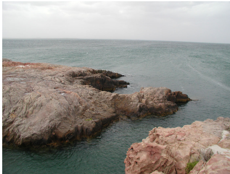
Figure 2. Rocky shore platform in the Península Gravina.

The low amount of precipitation (<300 mm/yr) and moderate thermal amplitude allow the growth of a sparse cover of grass and shrubby vegetation, consistent with the semi-arid climate of Patagonia. The oldest rocky substrate, Complejo Marifil, consists of Jurassic rhyolites, ignimbrites and volcanoclastic conglomerates. It is often covered by thin to very thick debris deposits and crops out basically in current and paleo rocky shore lines, islands and cliffs (Figure 2).