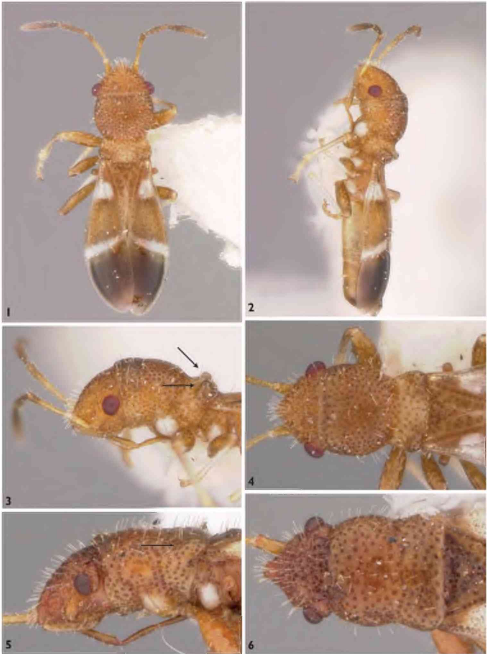
Figures 1–6. 1–4 Notocoderus argentinus , holotype male 1 Dorsal aspect 2 Lateral aspect 3 Head and pronotum, lateral aspect (arrows indicate position of posterolateral pronotal tubercles) 4 Head and pronotum, dorsal aspect 5, 6 Dycoderus picturatus 5 Head and pronotum, lateral aspect (arrow indicates rounded posterolateral pronotal angle lacking a distinct tubercle) 6 Head and pronotum, dorsal aspect.