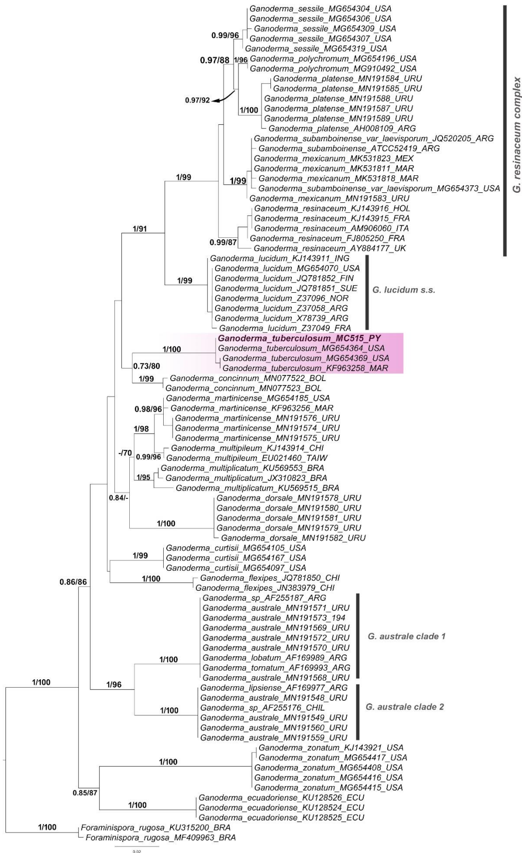
Figure 1 Phylogenetic tree based on ITS rDNA sequences generated by maximum likelihood showing the position and phylogenetic relationships of G. tuberculosum within the genus Ganoderma . Posterior probabilities (>0.95) and bootstrap values (>95%) are shown at the branches. Clade names follow Loyd et al. (2018) and Morera et al. (2021). Specimen studied is highlighted in boldface.

acetate fractions were the ones with the highest concentration in TPC and antioxidant concentration, so a previous washing with non-polar solvents (e.g., petroleum ether, hexane) is recommended to clean the extract lipid components as much as possible.