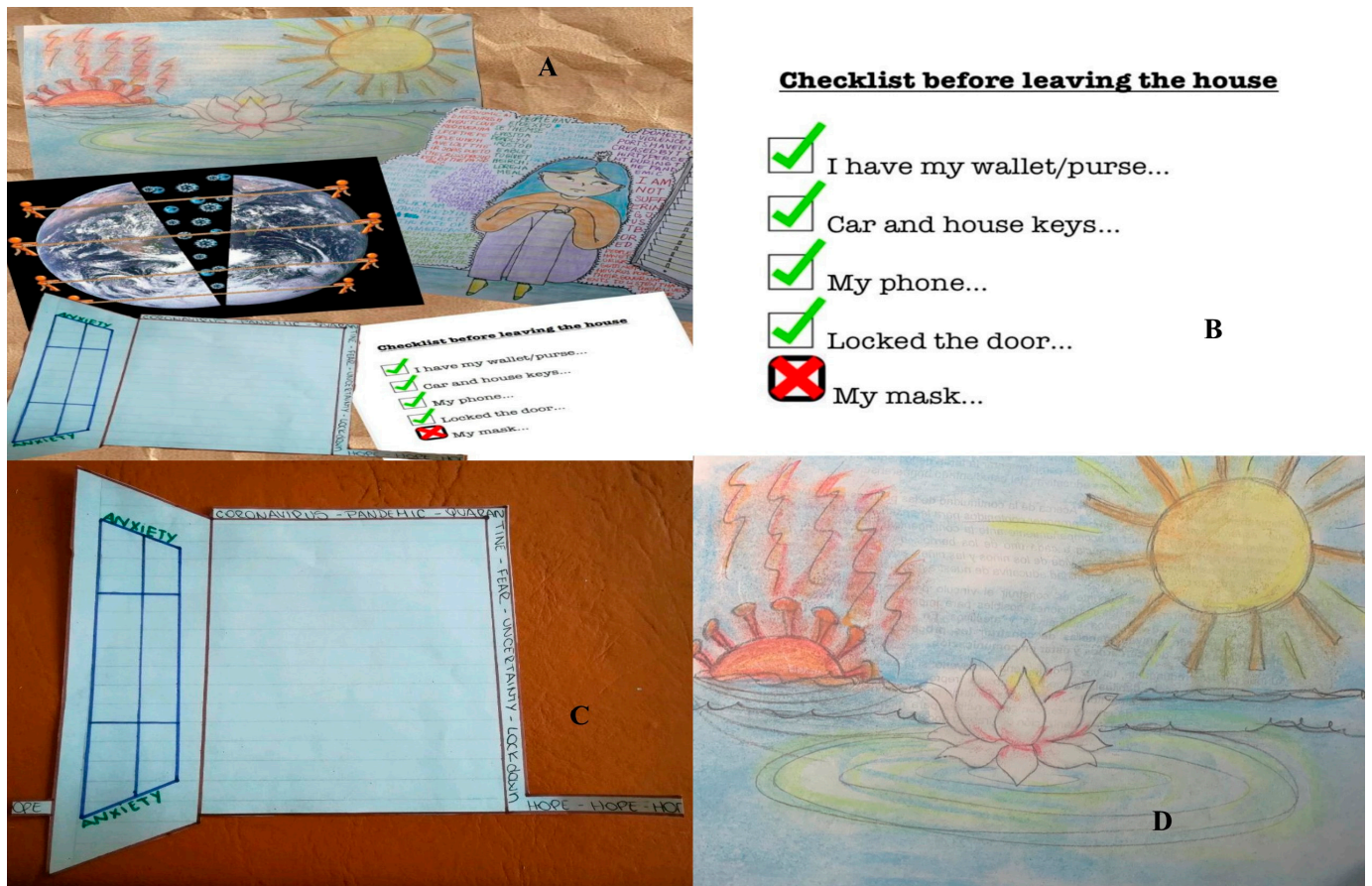
Figure 3. Emotional engagement through artistic work for transformation.

Door: ‘I tried to use a very ordinary object to communicate what I think the pandemic has affected our old lifestyle. The COVID-19 forced us to be indoors. Three months of social isolation have gone, and we are not sure when we will be able to leave our houses and remake our lives ( . . . ) In the frames of this door, which I metaphorically associated with the things that surround us, I included the negative feelings that are the ones that surface the most . When going down in the frame, what emerges is “ HOPE ”. This positive feeling that we all have, as we all want this pandemic to come to an end, is surpassed by the negative emotions. The window is the place from where we look to the outside; that place that seems to be very far away from our isolation perspective . Whenever we are ready to cross that door, we will for sure, need to be very much responsible (emphasis added)’.