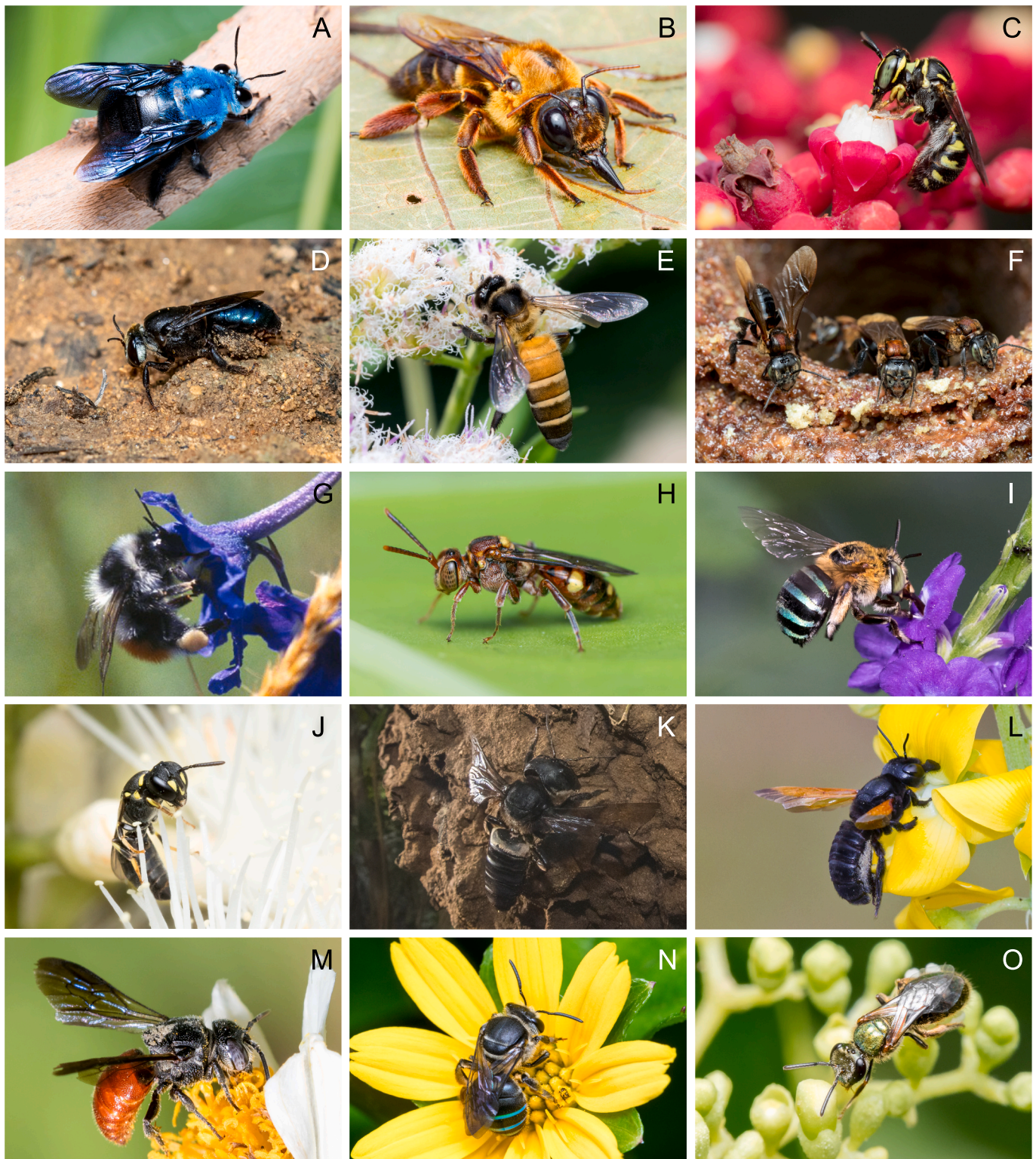
Fig. 1. Asian bee biodiversity. Apidae: A. Xylocopa insularis Smith; B. Xylocopa myops Ritsema; C. Ceratina collusor Cockerell; D. Ctenoplectra chalybea Smith; E. Apis dorsata Fabricius; F. Geniotrigona thoracica (Smith); G. Bombus supremus Morawitz; H. Nomada adusta Smith; and I. Amegilla andrewsi (Cockerell). Colletidae: J. Hylaeus penangensis (Cockerell). Megachilidae: K. Megachile pluto Smith; L. Megachile atrata Smith; and M. Euaspiis polynesia Vachal. Halictidae: N. Nomia iridescens Smith and O. Lasioglossum adonidiae (Cockerell).

reduction of pesticide use and pollution of water, light, and air; increase in landscape heterogeneity and semi-natural areas; implementation of pollinator-friendly practices across landscapes; protection and restoration of biodiverse areas and threatened species; and control of alien