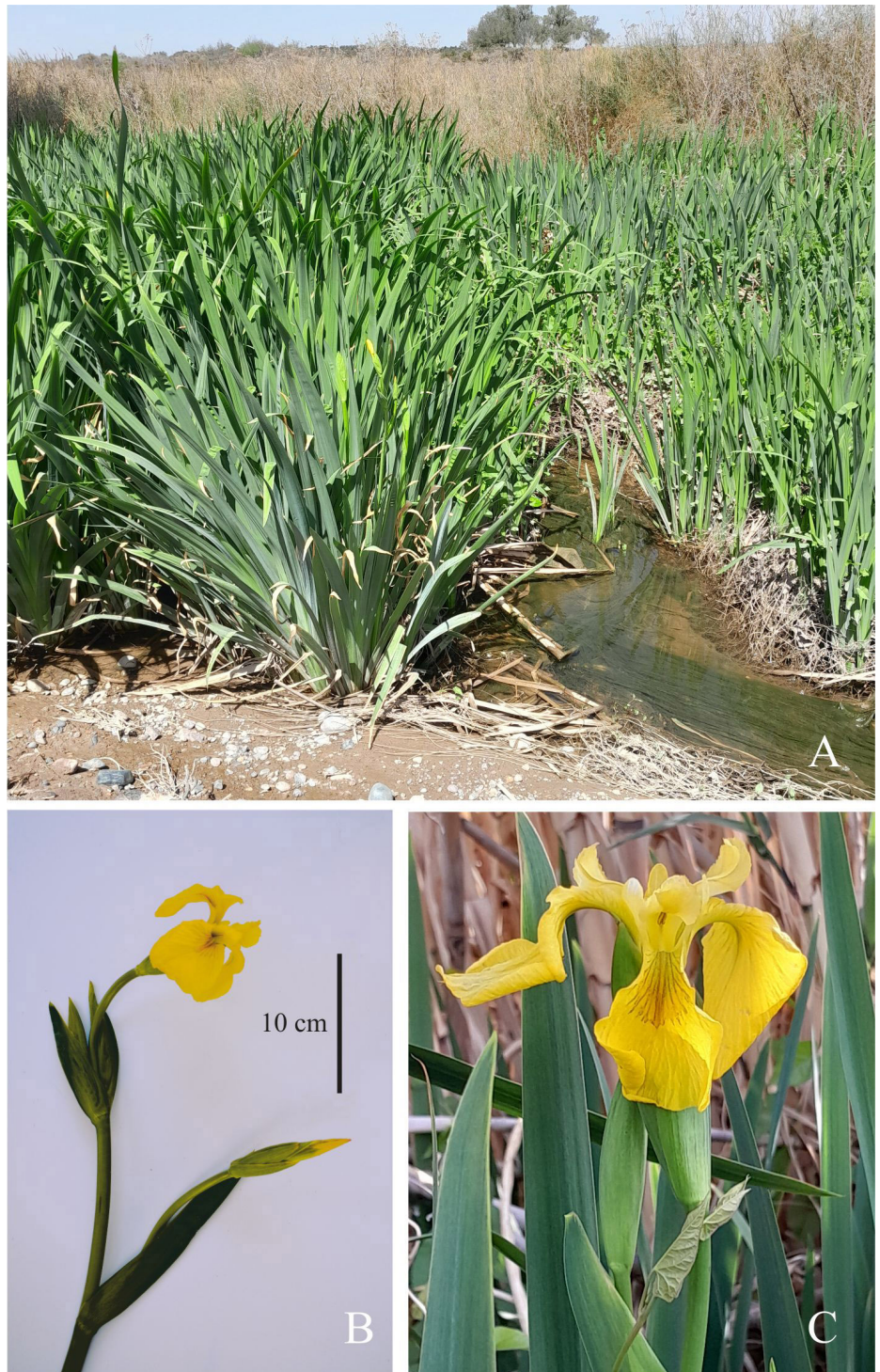
Figure 2. A. Patches of Iris pseudacorus in dryland wetlands of Mendoza, western Argentina. B. I. pseudacorus specimen collected in the Mendoza River basin and deposited in the MERL herbarium (IADIZA, CONICET - Mendoza). C. Detail of branch with flowers of I. pseudacorus .