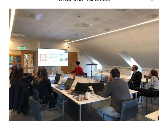
FIGURE 1 Participants on the fifth day of workshop discussing the results of the combined analysis composed of each member's analytical results.