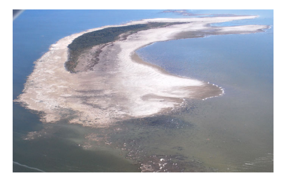
Fig. 2 Photo taken on May 5, 2010, of an island, 2.6 km long, in central Mar Chiquita lake (30°35'S, 62°43'W, in between points 2 and 5 in Fig. 1B). This was created in the late 1970s when a rising lake level inundated the low-lying scrublands up to the vegetation line shown in the photograph, making a topographic high spot an island. Since 2003, the steadily receding water level has exposed extensive mudflats, optimal flamingo breeding habitat

of Artemia and silverside. Water level data were obtained from monthly records provided by the Córdoba's provincial water resources agency. Starting in 2008, a complementary automatic recorder was installed by us. Change in water level between October and April was considered of interest, given the possibility of significant increases or decreases in water level affecting the nesting colonies. For example, flooding of nests might result from a sudden increase in lake level, or receding waters might negatively impact flightless juveniles by increasing the distance between nests and water.