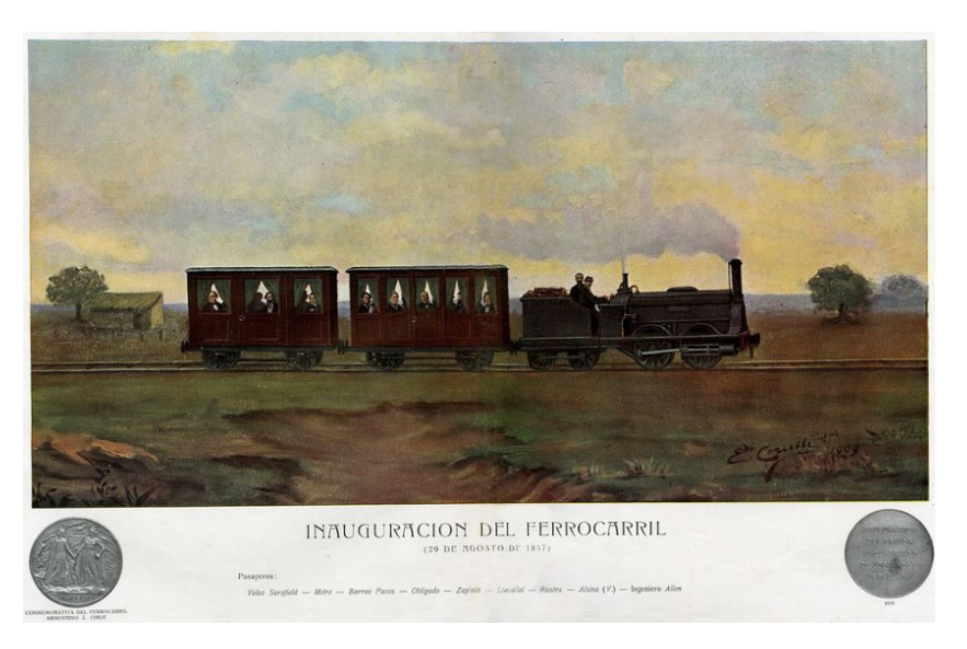
Figure 3. Inauguration of Ferrocarril del Oeste (29 August 1857). Painting by Eduardo Cerruti. Published in Ilustración Histórica Argentina, 9 July 1910.