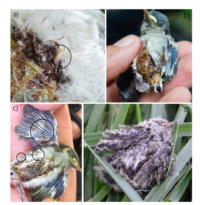
Figure 1. Nestlings with skin lesions in nests parasitized by Taphropiestes plaumanni larvae. a) Fork-tailed Flycatcher ( Tyrannus savana ) nestling with crust and lacerations in the belly, where a larvae is half burrowed in the affected area (circle); b) Masked Gnatcatcher ( Polioptila dumicola ) nestling with crusts and lacerations in the belly and subcaudal areas; c) The same Masked Gnatcatcher nestling found dead on the ground covered by at least 17 larvae (circles) and with holes in its belly of the same diameter of the larvae (dashed circle); d) Vermilion Flycatcher ( Pyrocephalus rubinus ) nestling dead for at least a day with larvae still in its body (circle).

T. plaumanni larvae. Moreover, we didn't find any other parasites in parasitized nests, nor signs of similar skins lesions in any of the ~400 unparasitized nests that reach the nestling stage, supporting the idea that the larvae of T. plaumanni should be the ones causing the skin lesions by feeding on nestling tissues (see also Figure 1a). In this sense, we believe that under certain circumstances, such as the small body size of the hosts (14 g for an adult Masked Gnatcatcher and ~13 g for an adult Vermilion Flycatcher; Alderete & Capllonch 2010, Dunning 2008) and a reduced number of siblings in the nest, T. plaumanni parasitism could promote nestling death.