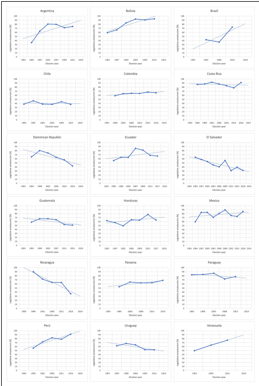
Figure I. Legislative Amateurism in Latin America, 1993–2019.