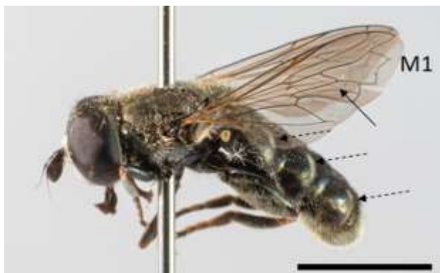
Fig. 3. Eumerus obliquus (Fabricius). M1 indicates M1 vein strongly bi-angulate, black arrow cross vein rm apical to middle of the cell dm and dashed arrows white dusted marks in tergites 2-4. Scale bar = 2 mm.

Our records of this species in Misiones are extremely plausible, while the Tucumán record is far from previous records in the Neotropical Region (Fig. 1). The individual from Tucumán was reared in a wet, decaying stem of Austrocylindropuntia subulata (Muehlenpf.) Backeb. (Cactaceae), where it developed along with larvae of one species of Copestylum Macquart (Syrphidae: Eristalinae: Volucellini) and Syrirta flaviventris (Syrphidae: Eristalinae: Milesiini). Unlike E. strigatus , which immature stages feeds on living bulbs (onion [ Allium cepa ] and Narcissus spp., both Amaryllidaceae), and tubers (potato [ Solanum tuberosum ; Solanaceae]) (Speight et al., 2013; Ricarte et al., 2017), Eumerus obliquus were reared in Mallorca (España) from wet, decaying platyclades of introduced cacti Opuntia maxima (Cactaceae) (Ricarte et al., 2008). Our record agrees with this result, being both known host plant species belonging to Cactaceae; Austrocylindropuntia subulata is the first report for one host plant in the Neotropical Region, for this exotic and invasive syrphid species.