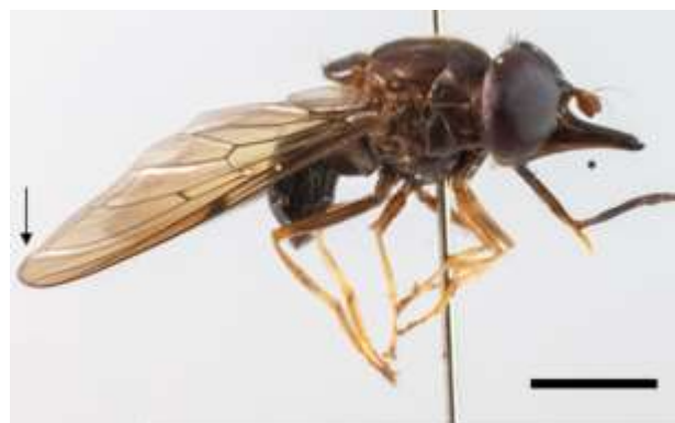
Fig. 2. Lateral habitus of Rhingia nigra Macquart. The asterisk indicates long porrect snout and black arrow veins C and R4+5 ending well posterior to wing apex. Scale bar = 2 mm.

The genus Rhingia (Eristalinae: Rhingiini) is easily recognized by the face produced into a long porrect snout without tubercle and veins C and R4+5 ending well posterior to the wing apex (Fig. 2). Rhingiini is one of the most important tribes of the subfamily Eristalinae, and is mainly present in the Holarctic, Nearctic, Oriental,