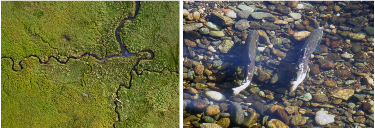
(Left) Polluted creeks in a coastal marsh in Oregon, United States. (Right) Chinook salmon in their riverine environment.

However, the ownership of water was left out of the agreement between the Māoris and the New Zealand state, diluting the interests of Indigenous inhabitants. The right to produce electricity from the water still rests with a private power company (guaranteed under pre-existing laws until 2039). While the Whanganui River was accorded rights of legal personhood, the interests of corporate energy producers were, more often than not, incorporated via the common law.