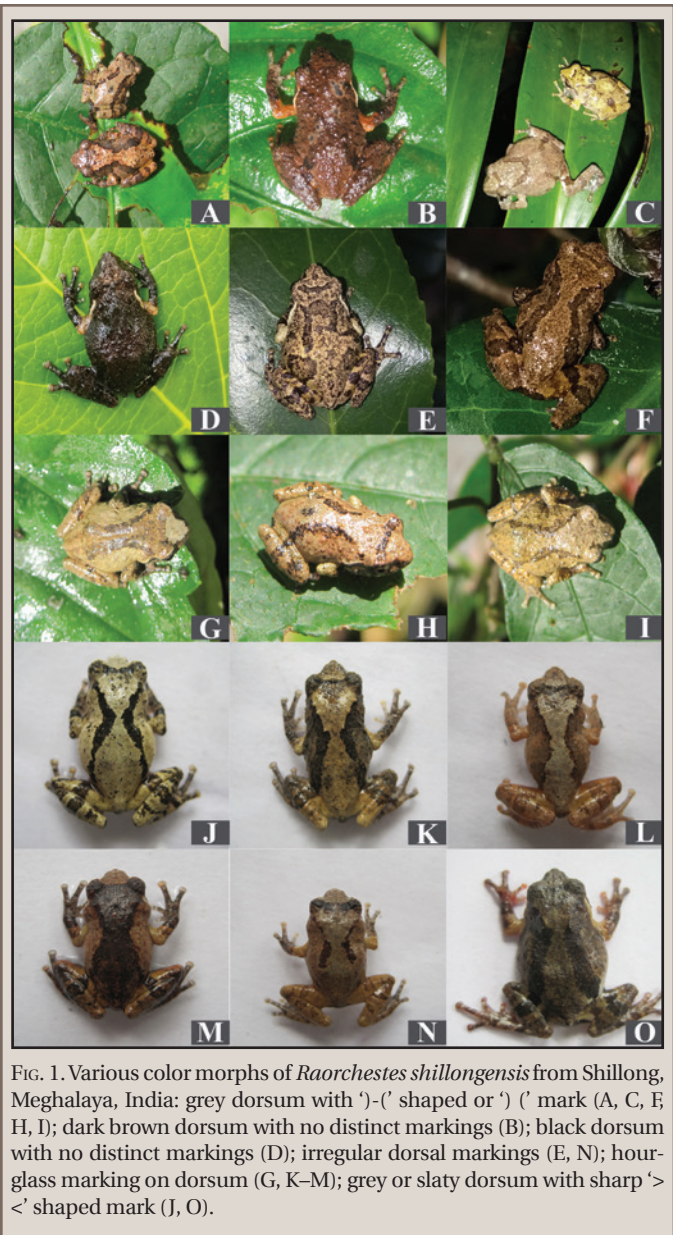
Fig. 1. Various color morphs of Raorchestes shillongensis from Shillong, Meghalaya, India: grey dorsum with 'Y'-shaped or 'H'-shaped mark (A, C, E, H, I); dark brown dorsum with no distinct markings (B); black dorsum with no distinct markings (D); irregular dorsal markings (E, N); hour-glass marking on dorsum (G, K–M); grey or slaty dorsum with sharp '><' shaped mark (J, O).

This work was supported by permit number FWC/Research/26/2164 dated 10 September 2018 issued by the