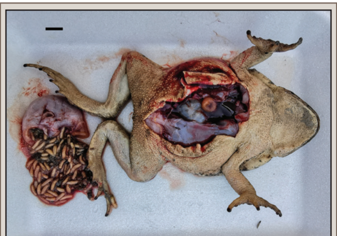
FIG. 1. Rhinella horribilis carcass from Puerto Vallarta, Jalisco, Mexico and stomach contents consisting of 147 undigested third instar maggots of Lucilia sp. Scale bar = 10 mm.

Rhinella horribilis is naturally distributed throughout the Neotropics, except the arid Andean areas and the Austral Temperate Forest region (Pereyra et al. 2021. Bull. Am. Mus. Nat. Hist. 447:1–155). The diet of this opportunistic toad in its native range is composed of a wide variety of terrestrial insects, chilopods, diplopods, crustaceans, arachnids, mollusks, annelids, and other anurans (Zug and Zug 1979. Smithson. Contr. Zool. 284:1–57; Carrasco-Fuentes 1989. B.S. Thesis, Escuela Nacional de Estudios Profesionales “Iztacala”, UNAM, México. 51 pp.; Cabrera Peña et al. 1997. Rev. Biol. Trop. 44/45:702–703; Torres-Quintero et al. 2008. Entomol. Mex. 7:136–141; Sampeiro-Marí et al. 2011. Caldasia 33:495–505). However, some of the above-referenced studies have not identified the food items to genus or species