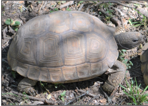
FIGURE 1. An Argentinian Tortoise ( Chelonoidis chilensis) from Villa Minetti, Santa Fe, Argentina.