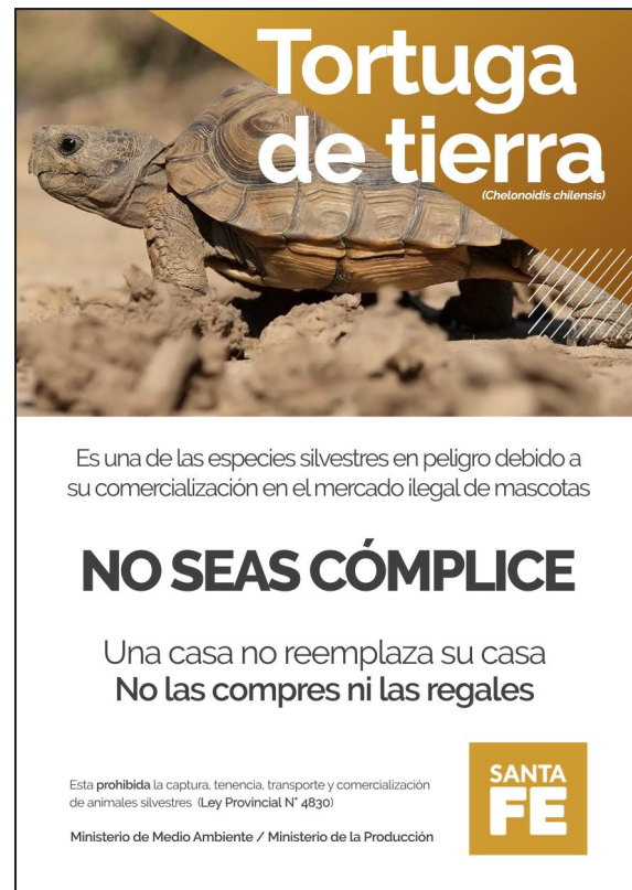
FIGURE 3. Educational campaign poster to promote the protection of the Argentinian Tortoise ( Chelonoidis chilensis ). The legend states “Tortoise: it is one of the endangered wild species due to its commercialization in the illegal pet market. Don’t be an accomplice. A house does not replace its house. Do not buy or give them away.”

Behavioral evaluation. —Tortoises showed the correct use of the available space and were basking and seeking shade according to environmental conditions. We also observed that their dependence on humans for their food was eliminated. This indicated to us their change in feeding behavior, and that the animals responded positively to the naturalization of the diet.