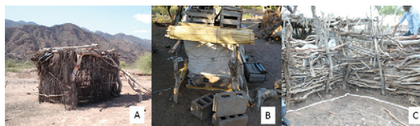
Fig. 2: habitats selected for study. A: chicken coop A; B: chicken coop B; C: goat corral.