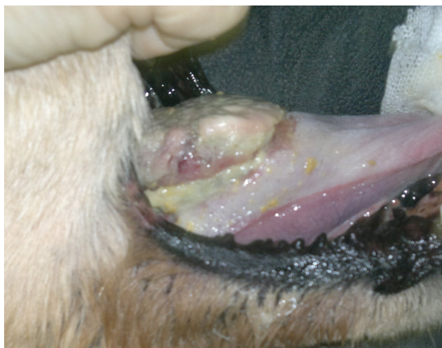
Figure 3: The patient seven days after the ECT. The tumor already started to shrink.

Figure 3 shows the patient seven days after the ECT. No sign of edema was present and patient displayed a clear improvement of its general condition. The tumor started to shrink to a size of 4.2 \times 3.4 \times 0.9 \text{ cm}^3 .