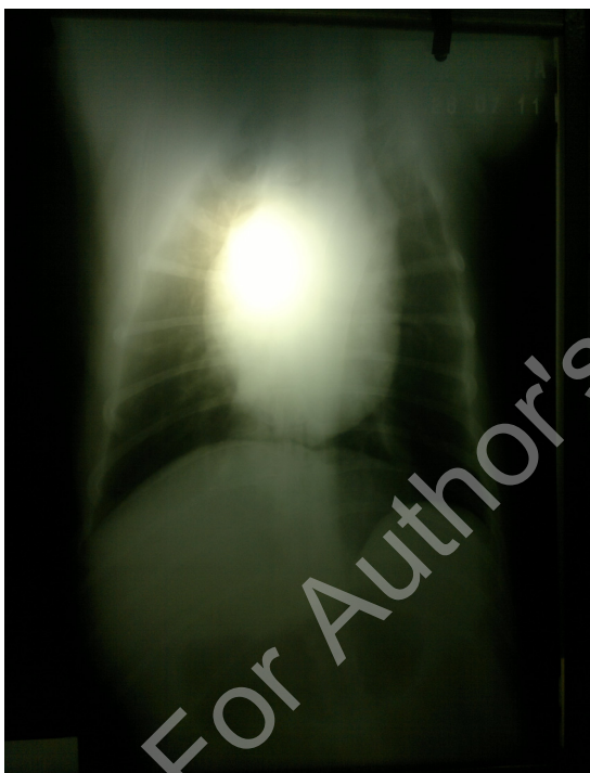
Figure 1: Chest X-ray of the patient. The x-ray image shows a dilated heart, with no signs of lung metastasis.

A 9 year-old, female, Golden Retriever was presented with cachexia, dehydration, sialorrhoea, and a bad general condition. The owner reported that the dog had difficulties in eating and drinking water in the previous month. Additionally, he reported that his kids didn't want to play with the dog because of the sialorrhoea and the bad smell coming out from his mouth.