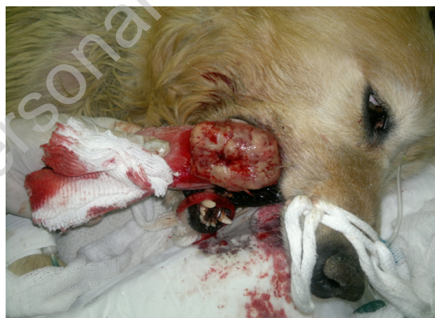
Figure 2: The patient at the time of the treatment. The tumor, located on the root of the tongue, is clearly seen.

Figure 2 shows the patient on the day of the treatment. Due to the bad general condition, ECT was the therapeutic modality chosen. To determine the dose of bleomycin the body surface of the dog was estimated using the formula: body\ surface\ in\ m^2 = \frac{10.1 \times (weight\ in\ grams)^{2/3}}{10000} [14]. The weight was 25 kg, so the calculated body surface was 0.86 m 2 .