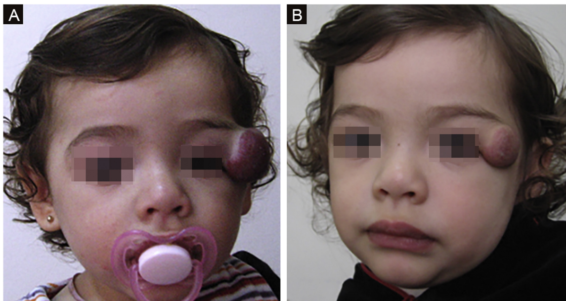
Figure 3 (A) Started treatment at 9 months old. (B) Poor response at 20 months old, when propranolol was stopped. Required surgical management (Patient #1).

conditions, arrhythmias, or a maternal history of connective tissue disease. 10