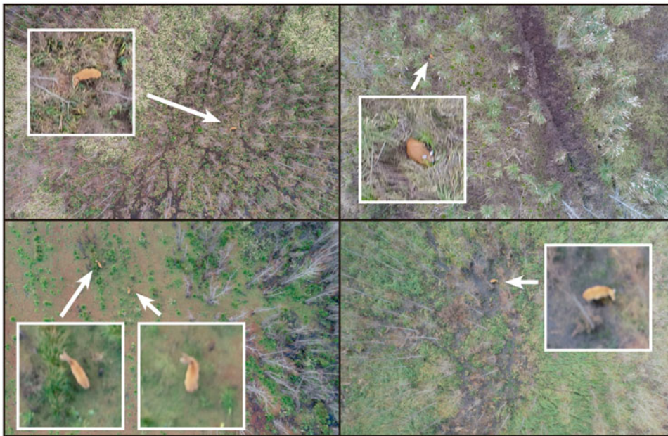
PLATE 1 Examples of records of the marsh deer Blastocerus dichotomus in different habitat types from photographs taken during UAV flights at an altitude of 45 m above ground level within the El Oasis property in the lower delta of the Paraná River, Argentina (Fig. 1), during 6–8 August 2019.

following a standardized protocol: zooming in digitally on the image and looking from left to right and from top to bottom for marsh deer. Overlapping sequential images were compared to avoid double counting. Each photograph was checked by at least two independent observers. The total number of marsh deer recorded by all observers, excluding multiple detections of the same individual by more than one observer, was used to estimate marsh deer density.