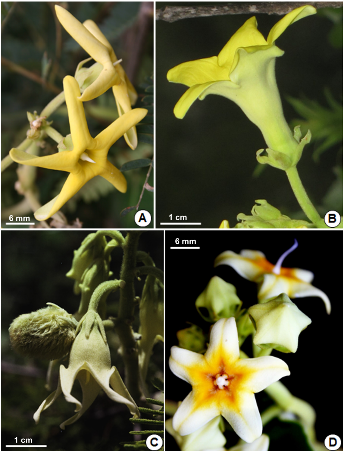
Fig. 2. A, Philibertia woodii . B, P. speciosa . C, P. longistyla . D, P. latiflora .. Color version at http://www.ojs.darwin.edu.ar/index.php/darwiniana/article/view/963/1228