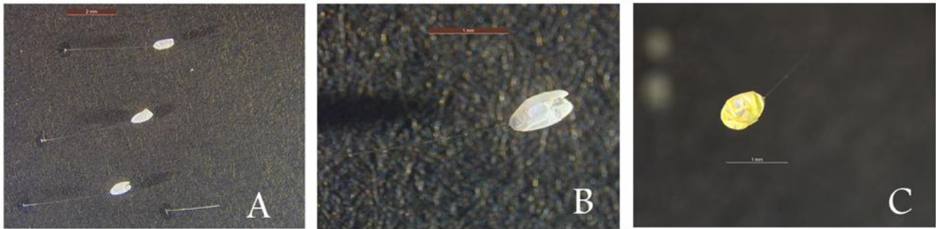
Fig. 3. Raisin-like eggs of Chrysoperla externa . a-b: hatched eggs. c: non-viable egg.