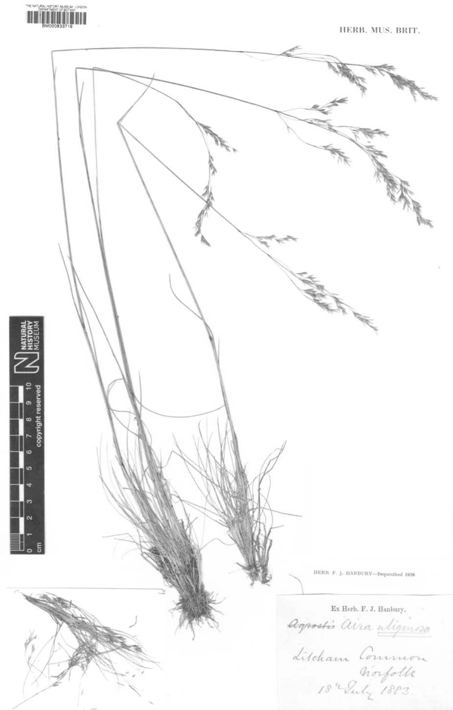
FIGURE 3. Type specimen of Aira setacea Huds. [= Deschampsia setacea (Huds.) Hack].