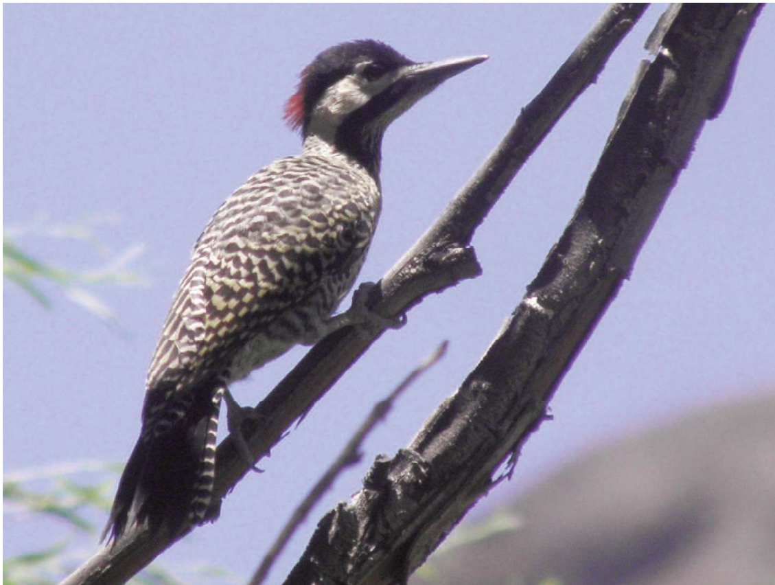
Figure 3. Adult specimen of Green-barred Woodpecker, Colaptes melanochloros