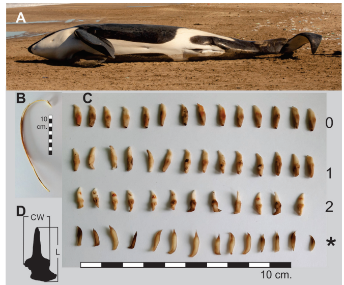
Figure 2. (A) Orca ( Orcinus orca ) male specimen stranded at La Caleta, Buenos Aires, Argentina. (B) Partially digested rib found in the stomach content analysis. (C) Comparison of the teeth found in the orca stomach (*) to the reference collection of franciscana ( Pontoporia blainvillei ) sorted by year class (0, 1 and 2 years old, respectively). (D) Scheme indicating the measurements taken. Total Length (L), and cingulum width (CW).

Orca predation on franciscana dolphins has been previously reported in Brazilian waters. The first record was found in the stomach content of a stranded orca in Rio Grande do Sul (38°48'15" S, 50°32'45" W; Ott and Danilewicz, 1998; Franciscana Management Area III (FMA III; Secchi et al. , 2003)). The second record was an observational study in Paraná (25°20' S, 48°05'