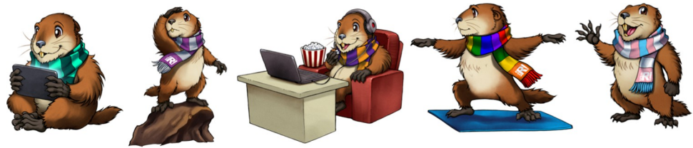
Fig 2. Margot the marmot was the useR! 2021 mascot. To represent the global and inclusive nature of the conference, Margot was drawn using scarves representing the colors of diverse communities of practice that are part of the large R community and specific groups of people we wanted to support explicitly. From left to right: Margot wearing scarves with the colors of MiR ( https://mircommunity.com ), R-Ladies ( https://rladies.org ), AfricaR ( https://africa-r.org ), and the LGBTQIA+ and transgender communities. Margot was created by Francisco Etchart and is available under a CC-BY-NC-SA license ( https://github.com/useRconf/visuals-2021 ). See alt-text in the “Alternative text for figures” section. MiR, Minorities in R.

https://doi.org/10.1371/journal.pcbi.1010164.g002