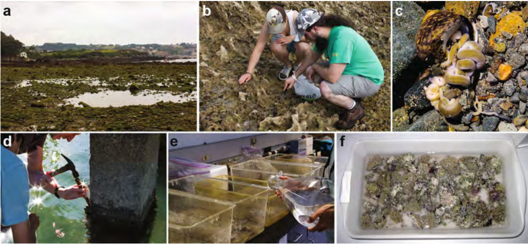
Fig. 2 Field collection of nemerteans. (a) A typical intertidal area where L. sanguineus can be found. (b) Direct collection of specimens under pebbles, rocks and shells. (c) Large specimen of Lineus lacteus inside a mollusk shell while eating its owner; the anterior end is deep within the shell. (d) Removal of a sample of the fouling community encrusted on the pylons of a pier. (e) Removed rubble is placed in trays and covered with sea water. (f) Rubble is spread out on the bottom of the tray, and allowed to become hypoxic, forcing nemerteans to come out of their shelter and allowing their collection