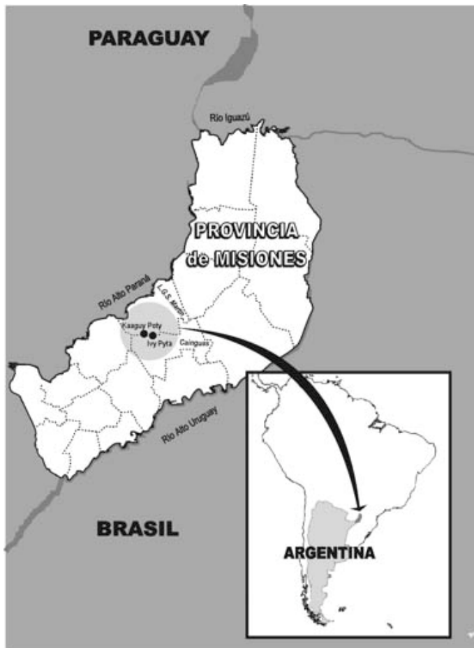
Figure 1. Mbya communities (Misiones province).

that might cause eventual harm. Once they start walking, their social interactions and mobility are widened considerably.