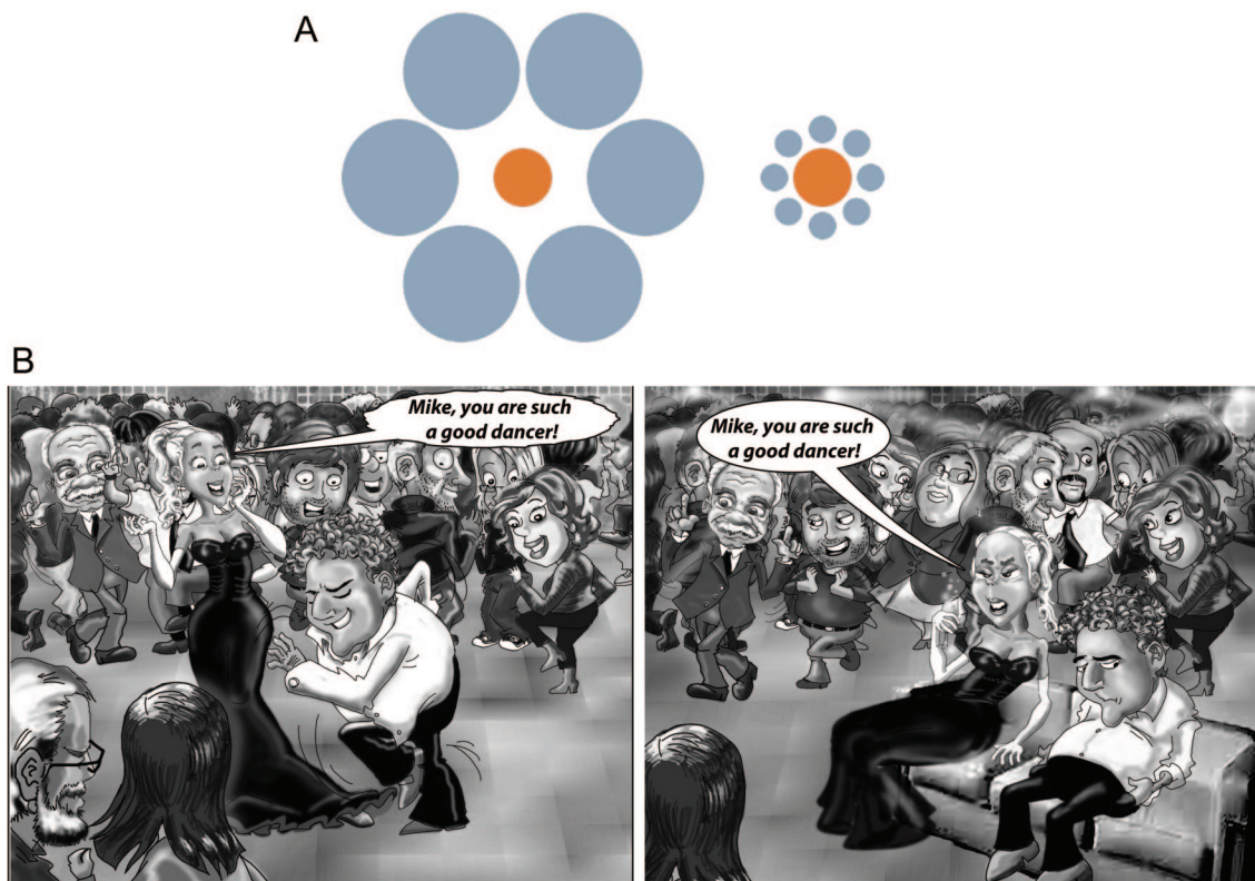
(A) The Ebbinghaus illusion. (B) The role of social context in semantic and situational meaning. Two different social contexts (in this case, indexed by the emotional expression, the dancing situation, and the other's actions) dramatically alter the meaning of the same sentence: "Mike, you are such a good dancer!" This figure makes a comparison between visual perception and social cognition by pointing out that they can both generate instances where the same stimulus is differentially experienced as a function of context. But there is also a difference. The perceptual illusion is obligatory (i.e., intrinsic to the hard-wiring of the visual system) whereas the utterance and interpretation of the comments in B are conditional. The femme fatale has the choice not to utter the comment and the young man has the option of interpreting the comment as wistful/friendly or sarcastic/cruel. The critical input of our brain (mainly prefrontal cortex) is probably based on its ability to coordinate conditional behaviors and interpretations in social situations. Illustration by Carlos Becerra (B).

the specific significance of an object. This is illustrated by figure 1B. Like the size of the circles in the Ebbinghaus illusion, the meaning of the sentence "Mike, you are such a good dancer!" is dependent on the contextual information.