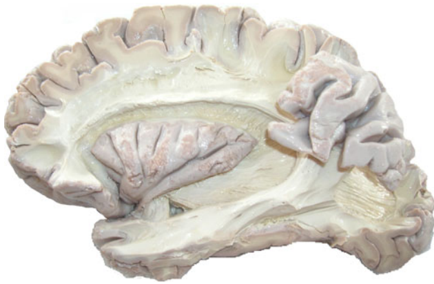
Fig. 1 Lateral view of human insula exposed by the removal of overlying opercula. Note the close proximity of the frontal, parietal, and temporal cortices which contribute to the seclusion of the insular cortex deep inside the lateral fissure of the brain. Reproduced with the permission of the Museum of neuroanatomy Tomas A Mascitti; Institute of Cognitive Neurology (INECO)