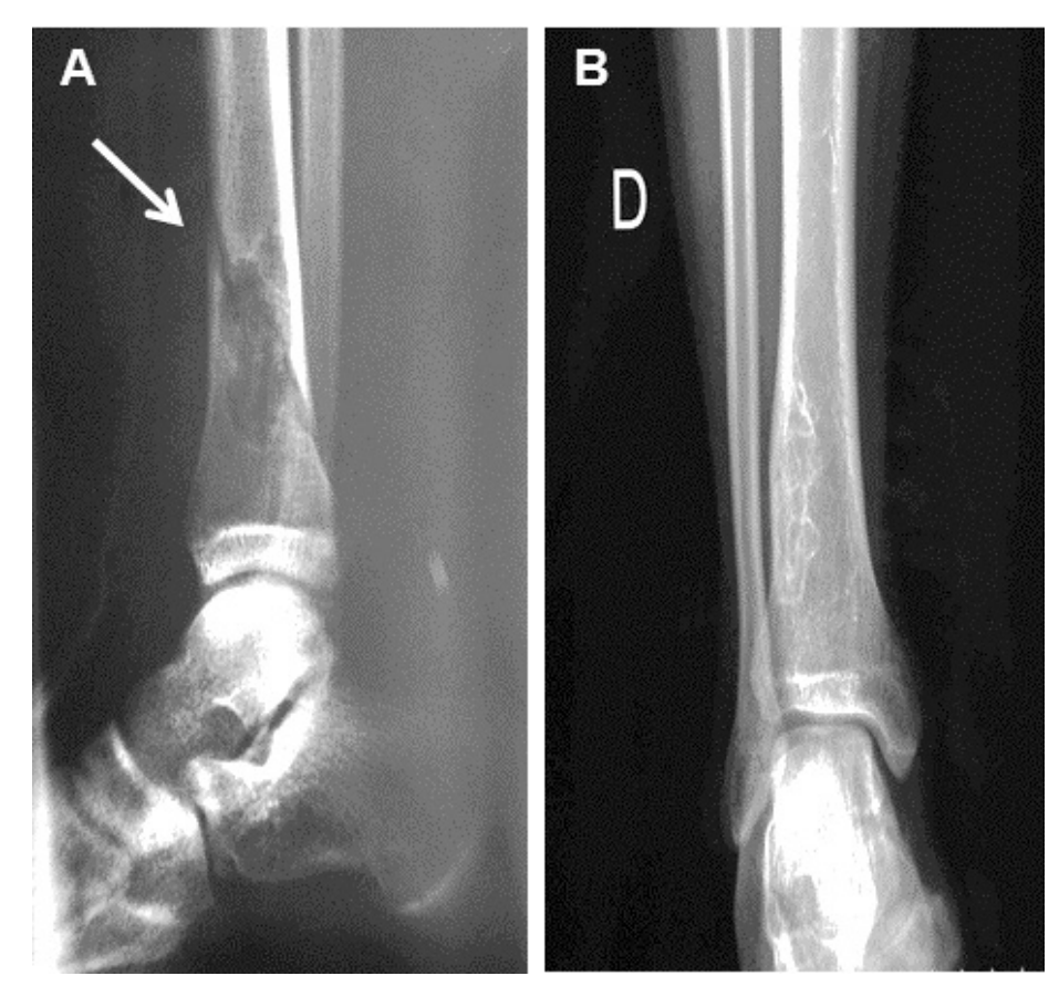
Figure 1 A and B - Lateral and antero posterior X-rays of the ankle taken at the time of the fracture (patient was 17 years old). A radiolucent lesion with well defined and sclerotic borders with multilobular appearance can be observed in the distal diaphyseal-metaphyseal region of the tibia. A bowing of the inner surface of the tibia is observed. The image is compatible with ossifying fibroma. Tibial fracture line (arrow) was observed.