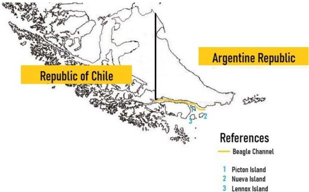
Image N° 2. Picton, Lennox and Nueva, Islands of the Beagle Channel with their sovereignty in dispute until 1984

Therefore, it is possible to argue that just until the signing of the Tratado de Paz y Amistad in 1984, which had a strong and positive impact on the improvement of the bilateral relations of both countries (Church, 2008), the relationship between Argentina and Chile was defined as having a high level of pugnacity because of the conflicts related to the definition of the territorial delimitation between them. The main territorial dispute was linked to the so-called “Beagle Conflict”, that is, the impossibility of reaching an agreement regarding the sovereignty of the Nueva, Picton and Lennox Islands.