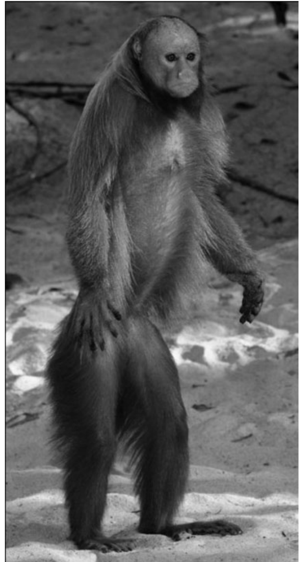
Fig. 1. Pitheciines can engage in terrestrial activity, but do so rarely in the wild (Cacajao calvus rubicundus semicaptive at Amazon Ecopark, Manaus, Brazil).

(1) More common in species spending more time in the lower strata of the forest canopy.