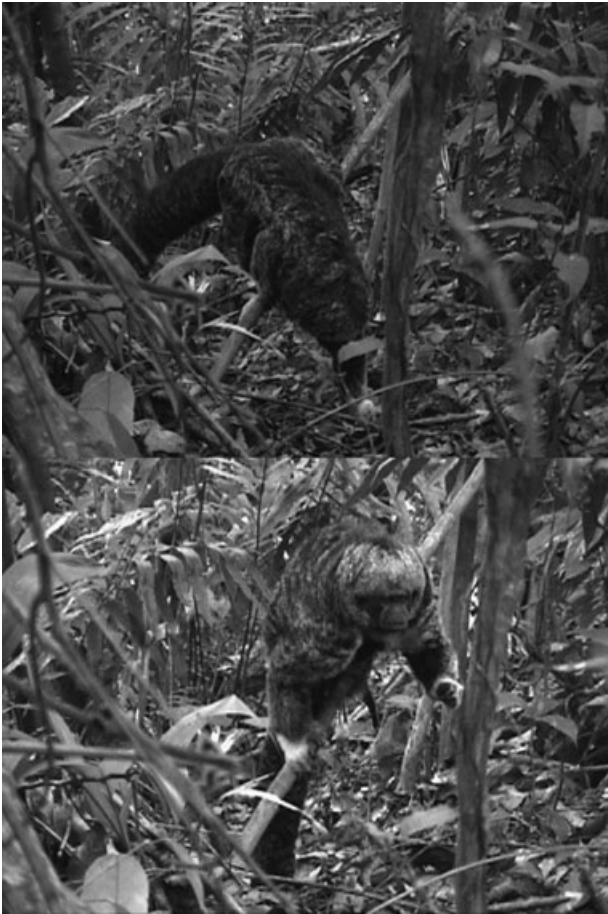
Fig. 3. Terrestrial foraging by Pithecia irrorata , southern Amazonian Peru.

observed that insect-feeding bouts could last for more than an hour, with the sakis spending much of their time close to the ground and making brief terrestrial forays to capture the ants. In P. pithecia [Harrison-Levine et al., 2003] the prey were large acridid grasshoppers ( Tropidacris spp.), and this behavior represented the single most frequent record of terrestrial behavior in the pitheciins, a total of 126 events. The sakis spent an average of 8.8 sec on the ground to capture each grasshopper, but invariably ascended to branches above 3 m from the ground to consume their prey [Harrison-Levine et al., 2003].