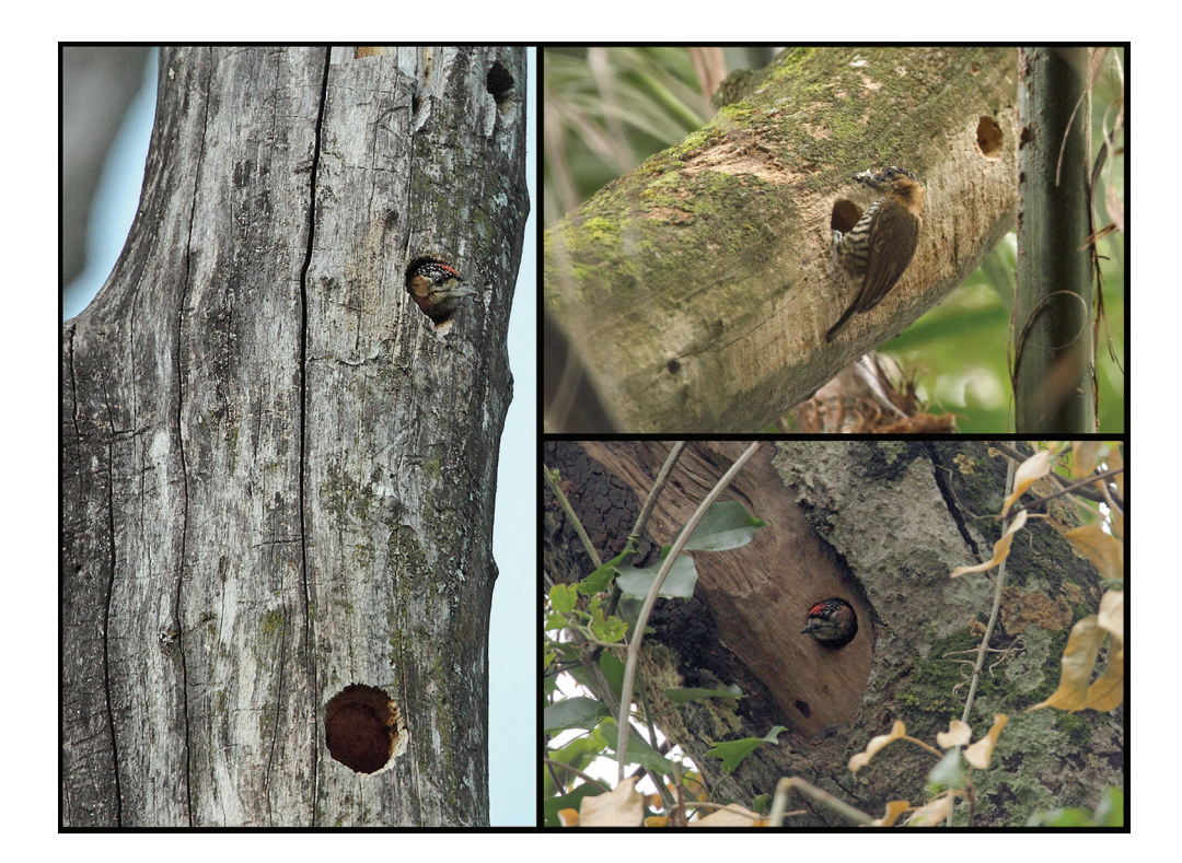
FIG. 1. Nests of Ochre-collared Piculet ( Picumnus temminckii ) at Parque Provincial Cruce Caballero, Misiones, Argentina. Left: male looking from cavity entrance of nest 2. Top right: female provisioning food at nest 3. Bottom right: male looking from cavity entrance of nest 4. Nest numbers correspond to those in Tables 1 and 2. Note cavity-starts above nests 2 and 3, and a possible cavity below nest 2; birds were never seen to use these excavations.

cavities in dead wood is typical for New World piculets (Skutch 1948, 1969, 1998; Haverschmidt 1951, Giraudo et al. 1993, de la Peña 2005, Pichorim 2006, Sedano et al. 2008, Gussoni et al. 2009, da Silva et al. 2012, Mauricio et al. 2013). White-wedged Piculets have even been found nesting in a loose branch suspended in a vine tangle (Gussoni et al. 2009). The African Piculet ( Verreauxia africana ) also apparently only makes cavities in wood stubs; however, the three Asian piculets, Speckled Piculet ( Picumnus innominatus ), White-browed Piculet ( Sasia achormis ), all make cavities in both wood stubs and bamboo (Winkler