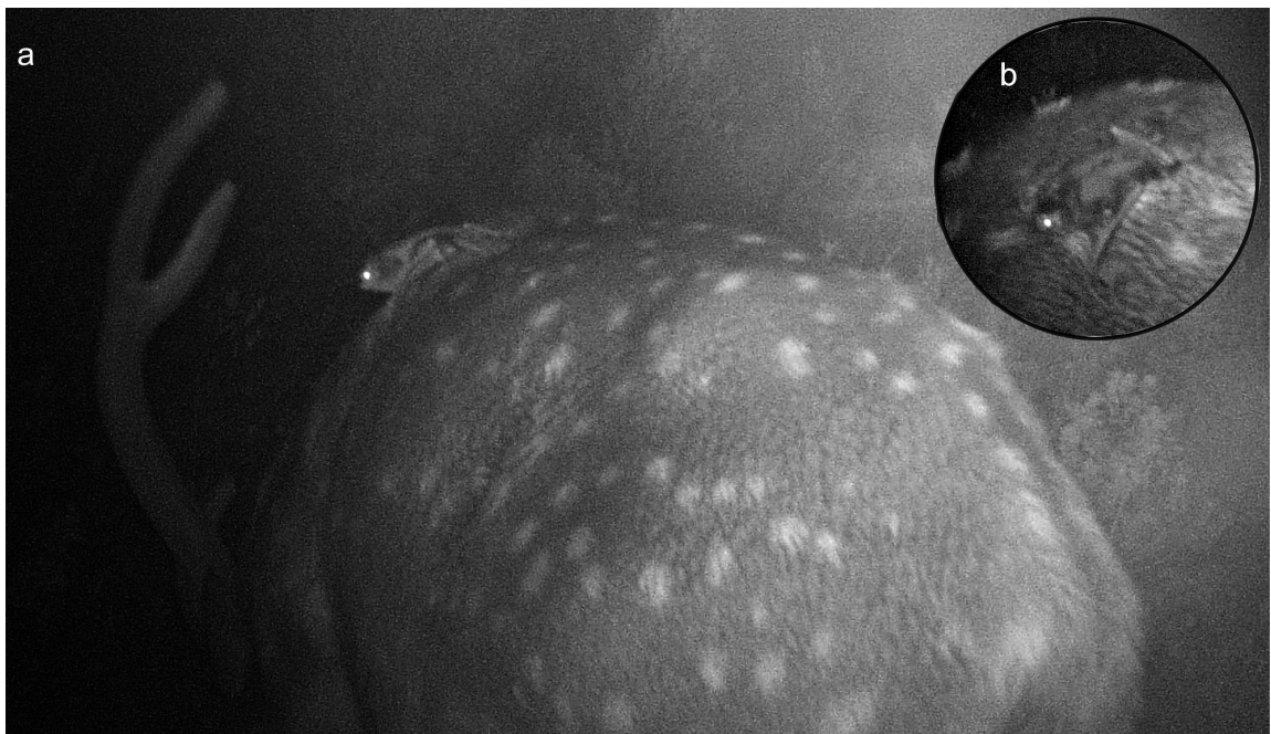
Figure 2. (a) A common vampire bat ( Desmodus rotundus ) rides on the left scapular area of a male axis deer in the National Park El Palmar, Argentina; (b) Zoom on the vampire of another photo.

the camping and houses area of the EPNP, and the vampires were observed sleeping in an abandoned house and in Jesuit ruins inside the EPNP (Maranta personal comments). However, attacks on people were not recorded so far. The lack of attacks on humans in this area is consistent with previous reports indicating that people