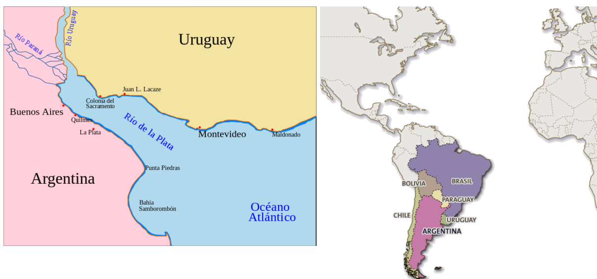
Map 1. Border between Argentina and Uruguay.

Argentina and Uruguay, thanks to their geographical vicinity basically in the area of the River Plate, which outlines a border extending some 500 kilometers, are countries whose destinies have been intertwined since their origins. Although their sizes are different, both regarding geographical extension and demography, Uruguay shares the same climate and soil as that of the Argentine pampa area.