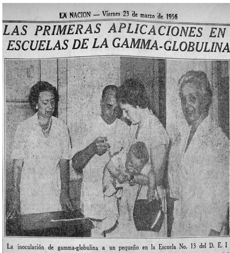
Figure 2. Newspaper La Nacion

Gamma globuline was used because, according to the Argentine authorities “...at present it is a comprehensive solution sought to annul the epidemic...”, with the intent of creating defenses in the younger ones 30 in order to counteract the effects or the development of the disease, while awaiting the arrival of consignments of Salk vaccines which took place after the main outbreak in the summer season. This is why it was in 1956 that the first Salk inoculations were carried out in both countries, increasing in number the following year. 31