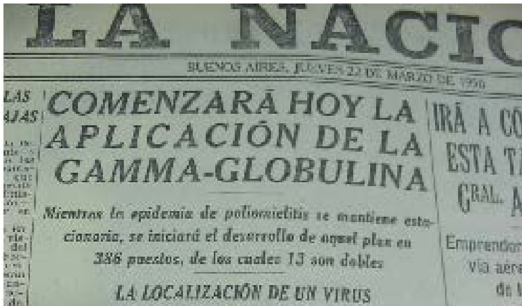
Figure 1. Newspaper La Nación

But availability of the Salk vaccine was complicated in these countries, unlike what happened in Europe, where most of the countries were using locally produced inactive vaccines, although they sometimes had to import them from the United States and Canada to cover the demand. 28 Argentina and Uruguay had to import them, which not only increased the costs of purchase but also slowed it down. This is why the Revolutionary Liberation government of Argentina, in the early months of 1956 and owing to the absence of Salk vaccine consignments, began administering the first gamma globuline shots in schools in March, 29 with the intention of immunizing 300,000 children between three months and five years of age.