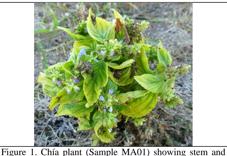
Figure 1. Chía plant (Sample MA01) showing stem and leaf deformation, dwarfism, chlorosis and leaf necrosis typical of viral infection.

Three out of 40 plants reacted with the antisera against CPMMV, all of them from north of Salta (22°12'S 63°26'W). Additionally, the plants positive for CPMMV were also tested for Begomovirus by PCR, using the begomovirus universal primers PAL1v1978/PAR1c496 (Rojas et al., 1993). No amplification was observed in the samples; therefore, they were considered negative for the infection with Begomovirus.