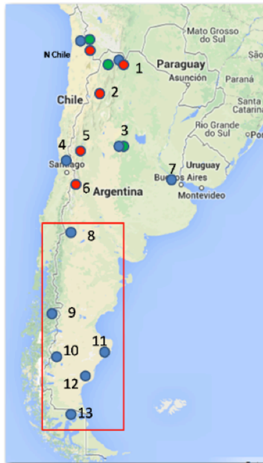
Figure 1. Areas and site mentioned in the text. 1)Huachichocana, Inca Cueva Cueva 7, Doncellas, Pintoscayoc, 2) Antofagasta de la Sierra 3) Intihuasi 4) Cueva Piuquenes 5) Los Morrillos, 6) Atuel, 7) Sarandí, Anahí, Garín 8) Chenque Haichol 9) Los carneros 10) Cerro Casa de Piedra 11) Cueva del Negro, 12) Punta Entrada, 13) Fell. Red dots: complete spearthrowers; Blue dots: bone hooks and grips; Green dots: stone hooks and grips

are dealing with hooks/ grips. Hence, I decided to record both (and this is the reason I call them bone spearthrower hooks/grips, BSHG from now on) since, whether they are grips or hooks, they signal the spearthrower presence.