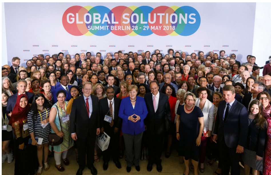
Global Solutions Summit 2018: Group photo with Chancellor Merkel

system of data property rights. We aim to rise to this challenge with a “digital initiative” to explore bold solution proposals for the future of digital governance.